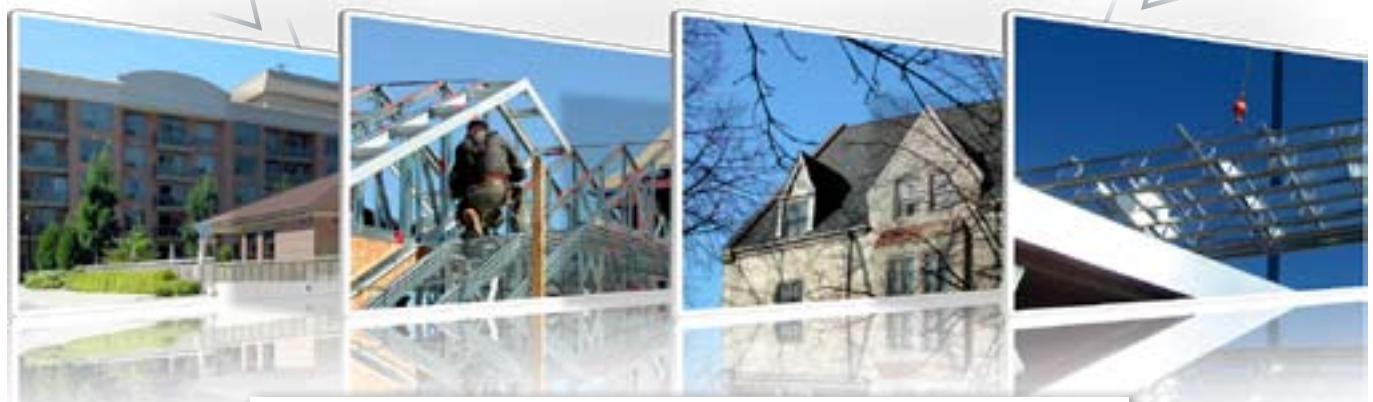
Residential / Commercial / Institutional LSF Projects